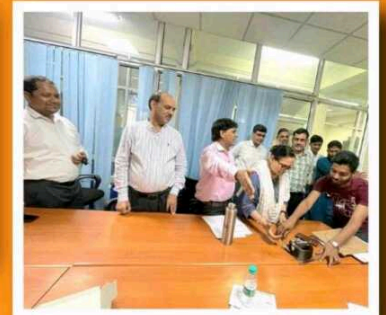
PHOTO GALLERY SOME MEMORABLE MOMENT OF OUR INSTITUTION EHTESHAM LAW