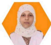
Umama (Roll no- B2603605) MUSLIM WOMAN RANK 4